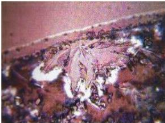
Sample: Hotel Reppert treated, 400x enlarged