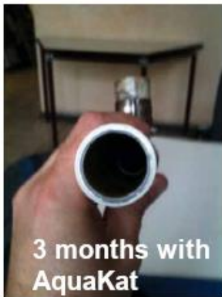
3 months with AquaKat

The AquaKat is an innovative Swiss device which, without filter, electricity or additional costs simply clips onto a pipe and through physical resonance as programmed into the AquaKat recreates the natural structure and the vitalizing properties of original source water.