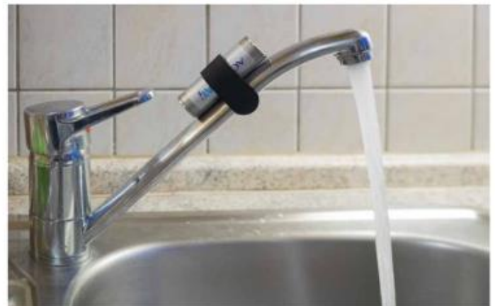
The AquaKat® S can simply be attached to the kitchen, sink or shower faucet.

Duration of use over 15 years 5 years warranty on manufacturing and equipment.