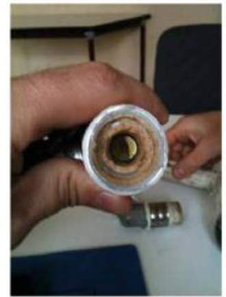
After three months of use, the line equipped with an AquaKat (left) has almost no trace of limestone, unlike the pipe without AquaKat.